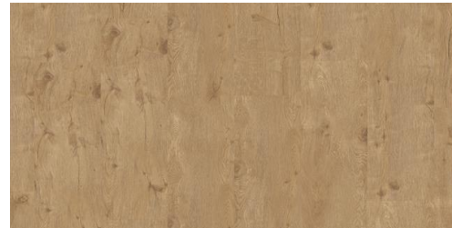
LVT Click flooring

The following figure shows an example of LVT Click flooring: